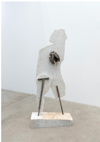
OLIVER LEE JACKSON Marble Sculpture No. 3 , 1983

Oil-based paints on panel 95 x 72 inches (241.3 x 182.9 cm.); 97 x 74 x 2 inches (246.4 x 188 x 5.1 cm.) Framed (OJA24-030)