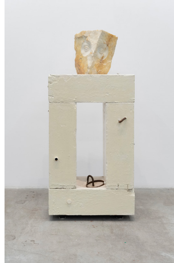
OLIVER LEE JACKSON Marble and Wood Sculpture , 1990

Watercolor on paper 29 3/4 x 41 5/8 inches (75.6 x 105.7 cm.); 33 1/2 x 45 7/16 x 2 inches (85.1 x 115.4 x 5.1 cm.) framed (OJA23-013)