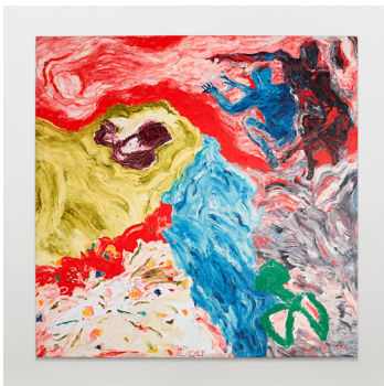
OLIVER LEE JACKSON Painting (6.8.89) , 1989

Oil-based paints on linen 96 1/2 x 96 1/2 inches (245.1 x 245.1 cm.) (OJA23-030)