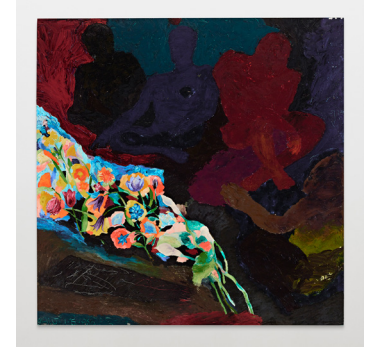
OLIVER LEE JACKSON Painting (1.5.88) , 1988

Marble, mixed media 55 x 27 x 15 inches (139.7 x 68.6 x 38.1 cm.) (OJA21-006)