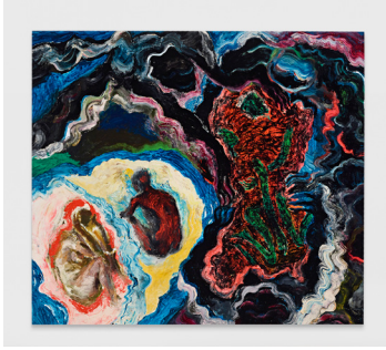
OLIVER LEE JACKSON Painting (7.8.86) , 1986

Oil-based paints on linen 95 3/4 x 108 inches (243.2 x 274.3 cm.) (OJA23-029)