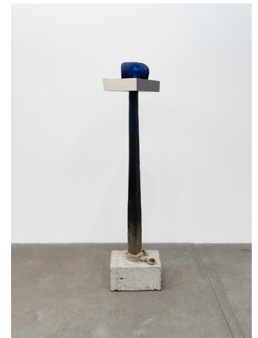
OLIVER LEE JACKSON Wood Sculpture (5.90) , 1990

Oil-based paints on gessoed linen 96 x 96 inches (243.8 x 243.8 cm.) (OJA25-009)