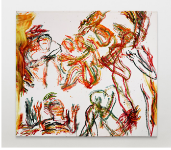
OLIVER LEE JACKSON Painting (12.12.84) , 1984

Oil pastel on linen 96 x 107 3/4 inches (243.8 x 273.7 cm.) (OJA24-011)