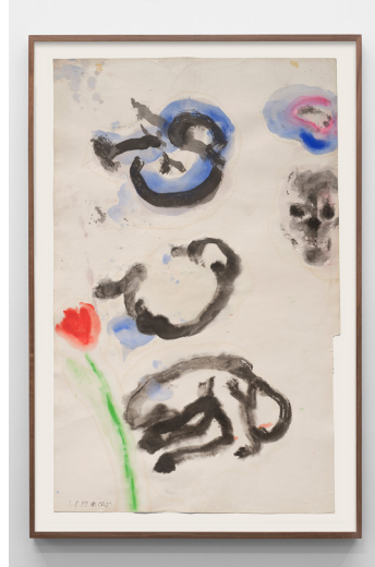
OLIVER LEE JACKSON Watercolor (8.8.89-II) , 1989

Oil pastel on linen 96 x 107 3/4 inches (243.8 x 273.7 cm.) (OJA24-011)