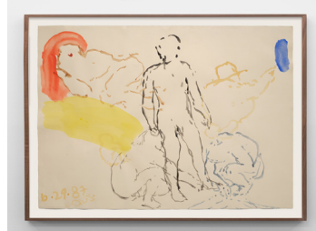
OLIVER LEE JACKSON Watercolor (6.29.87)-III , 1987

Oil-based paints on linen 95 3/4 x 108 inches (243.2 x 274.3 cm.) (OJA23-029)