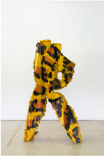
MICHAEL DEAN Unfuckintitled (fuckin' starvin'/hungry) , 2023

Reinforced concrete and color pigment 65 1/2 x 39 x 27 inches (166.4 x 99.1 x 68.6 cm.) (MD23-003)