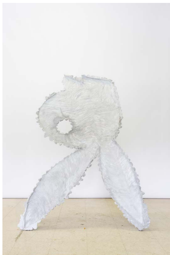
MICHAEL DEAN Unfuckintitled , 2023

Reinforced concrete 62 1/2 x 50 1/2 x 17 1/2 inches (158.8 x 128.3 x 44.5 cm.) (MD23-004)