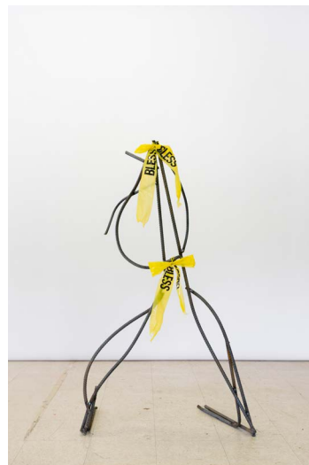
MICHAEL DEAN (Unfuckintitled) , 2023

Reinforced concrete 62 1/2 x 50 1/2 x 17 1/2 inches (158.8 x 128.3 x 44.5 cm.) (MD23-004)