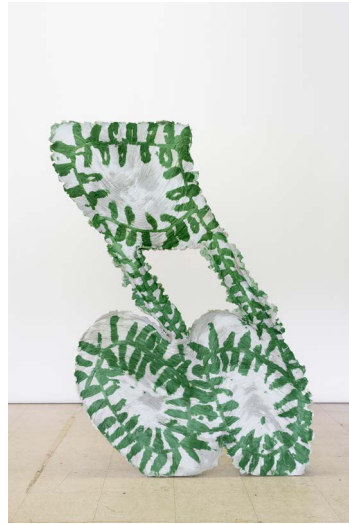
MICHAEL DEAN Unffffffffffuckintitled (music playing) , 2023

Reinforced concrete and color pigment 65 1/2 x 39 x 27 inches (166.4 x 99.1 x 68.6 cm.) (MD23-003)