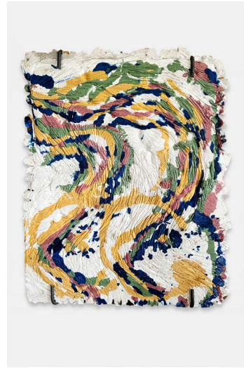
MICHAEL DEAN (Unfuckintitled) the bunnies is the music the music is the bunnies and cherries etfuckincetera , 2023

Reinforced concrete and green pigment 65 1/2 x 46 x 13 1/2 inches (166.4 x 116.8 x 34.3 cm.) (MD23-002)