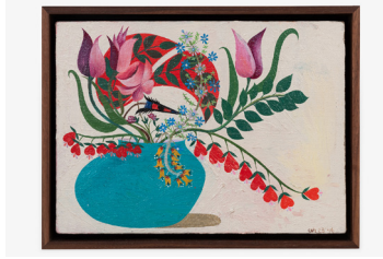
CLARE ROJAS Bouquet eye , 2018

Oil on linen 7 x 10 inches (17.8 x 25.4 cm.); 8 x 11 x 1 5/8 inches (20.3 x 27.9 x 4.1 cm.) framed (CLR23-001)