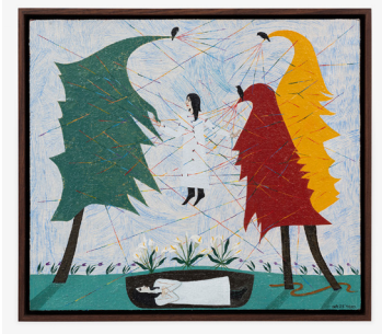
CLARE ROJAS Rainbow light healing energy from the trees , 2023

Oil on linen 15 1/2 x 17 1/2 inches (39.4 x 44.5 cm.); 16 1/8 x 18 1/8 x 1 1/2 inches (41 x 46 x 3.8 cm.) framed (CLR23-004)