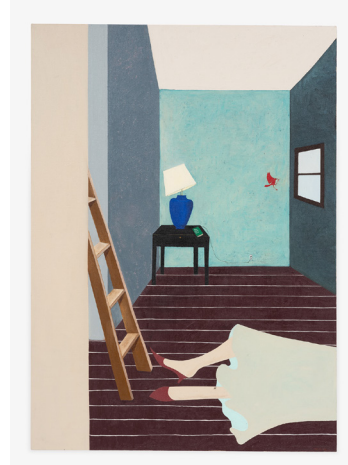
CLARE ROJAS They Were Both Stuck Inside , 2022

Oil on linen 16 x 18 inches (40.6 x 45.7 cm.); 17 1/4 x 19 1/4 x 1 3/4 inches (43.8 x 48.9 x 4.4 cm.) framed (CLR23-002)