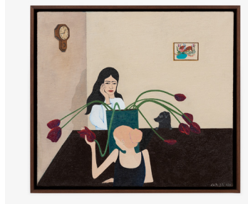
CLARE ROJAS It all fell down , 2023

Oil on linen 7 x 10 inches (17.8 x 25.4 cm.); 8 x 11 x 1 5/8 inches (20.3 x 27.9 x 4.1 cm.) framed (CLR23-001)