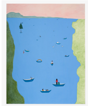
CLARE ROJAS We Are All in the Same Boat , 2023

Oil on linen 15 1/2 x 17 1/2 inches (39.4 x 44.5 cm.); 16 1/8 x 18 1/8 x 1 1/2 inches (41 x 46 x 3.8 cm.) framed (CLR23-004)