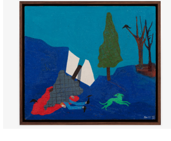
CLARE ROJAS A Tree Fell , 2022

Oil on linen 24 x 30 inches (61 x 76.2 cm.); 25 1/8 x 31 1/4 x 2 1/8 inches (63.8 x 79.4 x 5.4 cm.) framed (CLR22-066)