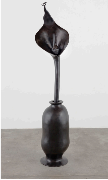
CLARE ROJAS Emmanuelle (The Lord is Among Us) , 2023

Bronze 86 x 20 x 20 inches (218.4 x 50.8 x 50.8 cm.) (CLR23-003)