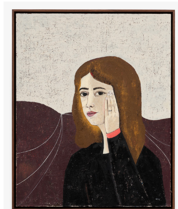
CLARE ROJAS Portrait of Blushing , 2018

Oil on linen 16 x 12 inches (40.6 x 30.5); 17 1/8 x 13 1/8 x 1 5/8 inches (43.5 x 33.3 x 4.1 cm.) (CLR23-006)