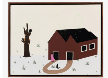
CLARE ROJAS Her world got smaller , 2022

Oil on linen 60 x 43 1/8 inches (152.4 x 109.5 cm.) (CLR22-064)