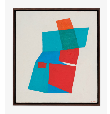
CLARE ROJAS The Part That You Can See Through , 2022

Oil on linen 40 x 50 inches (101.6 x 127 cm.) (CLR22-072)