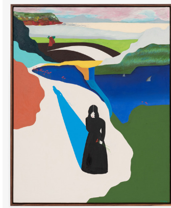
CLARE ROJAS The Long Shadow at the End of a Long Road at Sunset , 2023

Acrylic and gouache on panel 84 x 96 inches (213.4 x 243.8 cm.) (CLR22-068)