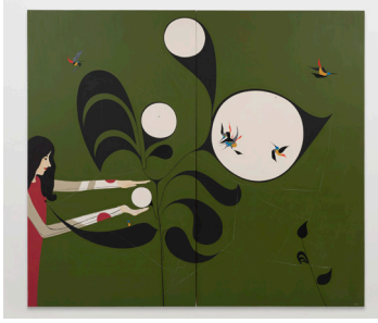
CLARE ROJAS The Glowing Night Shade , 2022

Acrylic and gouache on panel 84 x 96 inches (213.4 x 243.8 cm.) (CLR22-068)