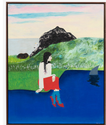
CLARE ROJAS Sharks Point , 2023

Oil on linen 13 x 15 inches (33 x 38.1 cm.) (CLR22-071)