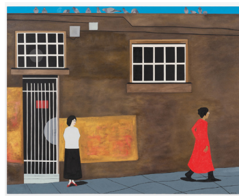
CLARE ROJAS The Bus Stop , 2023

Oil on linen 15 x 13 inches (38.1 x 33 cm.); 6 1/16 x 14 1/16 x 1 5/8 inches (40.8 x 35.7 x 4.1 cm.) framed (CLR23-005)