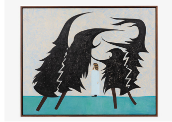
CLARE ROJAS When The Trees Were Fighting , 2023

Oil on linen 50 x 40 inches (127 x 101.6 cm.); 51 1/2 x 41 1/2 x 2 1/8 inches (130.8 x 105.4 x 5.4 cm.) framed (CLR22-074)