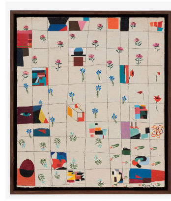
CLARE ROJAS Abstract and Flower , 2023

30 x 24 inches (76.2 x 61 cm.); 31 1/8 x 25 1/8 x 1 3/4 inches (79.1 x 63.8 x 4.4 cm.) framed (CLR22-077)