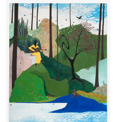
CLARE ROJAS The Sacred Bird Tree , 2022

Oil on linen 50 x 40 inches (127 x 101.6 cm.); 51 1/2 x 41 1/2 x 2 1/8 inches (130.8 x 105.4 x 5.4 cm.) framed (CLR22-075)