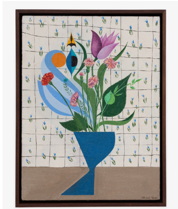
CLARE ROJAS I'm still pretty bouquet , 2023

Acrylic and gouache on panel 29 5/8 x 37 3/4 inches (75.2 x 95.9 cm.); 31 3/8 x 39 5/8 x 2 1/2 inches (79.7 x 100.6 x 6.3 cm.) framed (CLR22-069)