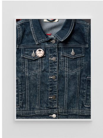
ANNETTE KELM Jeans Buttons, End Racism , 2023

Archival pigment print 78 7/8 x 59 1/8 inches (200.4 x 150.3 cm.); 79 3/4 x 60 1/8 x 1 3/4 inches (202.6 x 152.7 x 4.4 cm.) framed Edition of 6 plus 2 artist's proofs (ANK23-004)