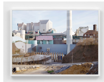
ANNETTE KELM Travertinsäulen, Recyclingpark Neckartal, Winter , 2019

Archival pigment print 39 2/3 x 29 2/3 inches (100.6 x 75.4 cm.); 40 1/4 x 30 3/8 x 1 1/2 inches (102.2 x 77.2 x 3.8 cm.) framed Edition of 6 plus 2 AP (ANK19-009)