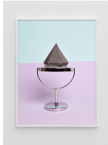
ANNETTE KELM Diamond Mirror , 2023

Archival pigment print 55 1/4 x 41 1/2 inches (140.4 x 105.3 cm.); 56 1/8 x 42 3/8 x 1 3/4 inches (142.6 x 107.6 x 4.4 cm.) framed Edition of 6 plus 2 artist's proofs (ANK23-005)