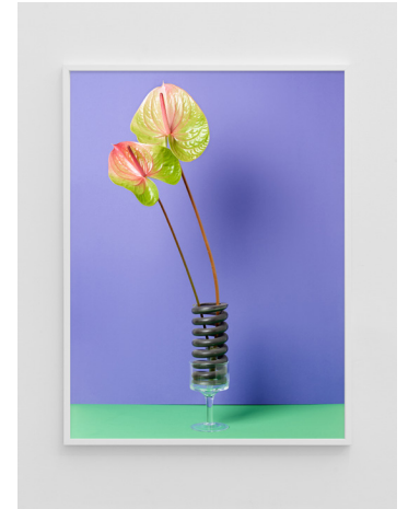
ANNETTE KELM Laceleave (Shadow) , 2021

Archival pigment print 27 3/4 x 20 5/8 inches (70.4 x 52.3 cm.); 28 1/4 x 21 3/8 x 1 1/2 inches (71.8 x 54.3 x 3.8 cm.) framed Edition of 6 plus 2 artist's proofs (ANK23-002)