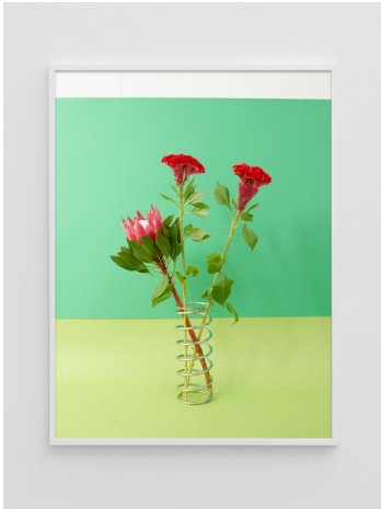
ANNETTE KELM Coxcomb Red , 2023

Archival pigment print 27 3/4 x 20 5/8 inches (70.4 x 52.3 cm.); 28 1/4 x 21 3/8 x 1 1/2 inches (71.8 x 54.3 x 3.8 cm.) framed (ANK23-001)