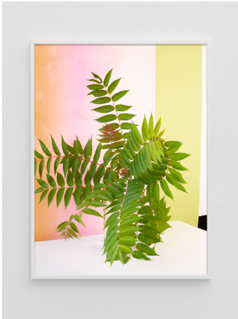
ANNETTE KELM Sumach / Essigbaum , 2023

Archival pigment print 78 7/8 x 59 1/8 inches (200.4 x 150.3 cm.); 79 3/4 x 60 1/8 x 1 3/4 inches (202.6 x 152.7 x 4.4 cm.) framed Edition of 6 plus 2 artist's proofs (ANK23-004)