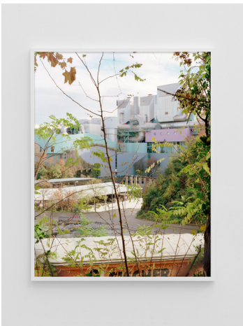
ANNETTE KELM Travertinsäulen, Recyclingpark Neckartal, Sommer , 2019

Archival pigment print 47 1/4 x 35 3/8 inches (120 x 90 cm.); 48 1/8 x 36 1/4 x 1 1/2 inches (122.2 x 92.1 x 3.8 cm.) framed Edition of 6 plus 2 artist's proofs (ANK22-001)