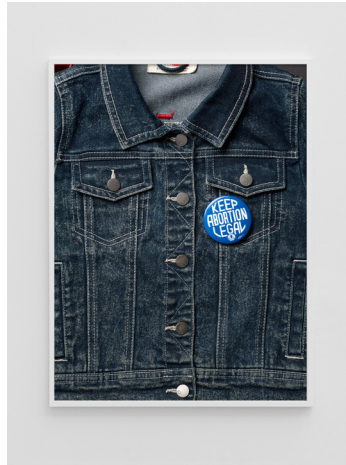
ANNETTE KELM Jeans Buttons, Keep Abortion Legal , 2023

Archival pigment print 21 3/4 x 16 3/8 inches (55.4 x 41.5 cm.); 22 1/4 x 16 7/8 x 1 1/2 inches (56.5 x 42.9 x 3.8 cm.) framed Edition of 6 plus 2 artist's proofs (ANK23-010)