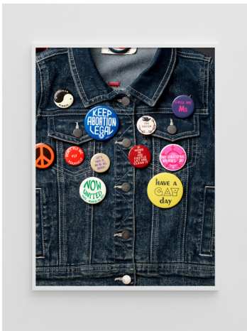
ANNETTE KELM Jeans Buttons , 2023

Archival pigment print 21 3/4 x 16 3/8 inches (55.4 x 41.5 cm.); 22 1/4 x 16 7/8 x 1 1/2 inches (56.5 x 42.9 x 3.8 cm.) framed Edition of 6 plus 2 artist's proofs (ANK23-008)