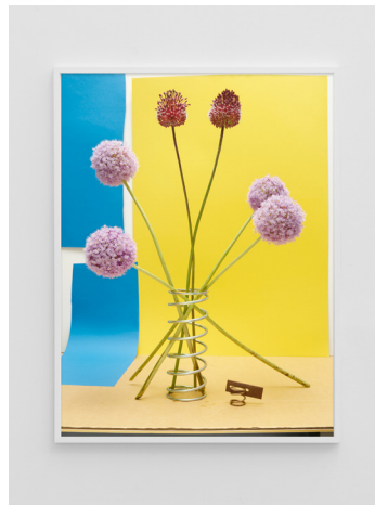
ANNETTE KELM Allium (Together) , 2021

Archival pigment print 21 3/4 x 16 3/8 inches (55.4 x 41.5 cm.); 22 1/4 x 16 7/8 x 1 1/2 inches (56.5 x 42.9 x 3.8 cm.) framed Edition of 6 plus 2 artist's proofs (ANK23-006)