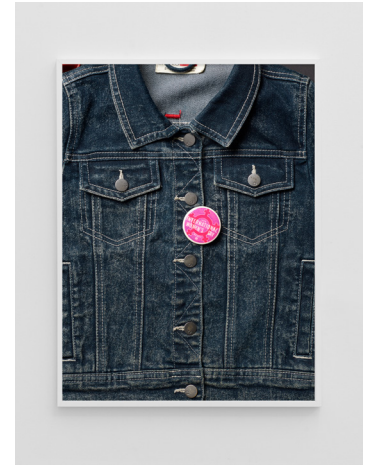
ANNETTE KELM Jeans Buttons, International Women's Day , 2023

Archival pigment print 21 3/4 x 16 3/8 inches (55.4 x 41.5 cm.); 22 1/4 x 16 7/8 x 1 1/2 inches (56.5 x 42.9 x 3.8 cm.) framed Edition of 6 plus 2 artist's proofs (ANK23-007)