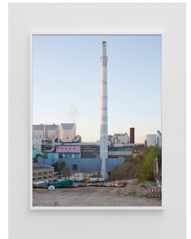
ANNETTE KELM Travertinsäulen, Recyclingpark Neckartal, morgens , 2019

Archival pigment print 29 2/3 x 39 2/3 inches (75.4 x 100.6 cm.); 30 3/8 x 40 1/4 x 1 1/2 inches (77.2 x 102.2 x 3.8 cm.) framed Edition of 6 plus 2 AP (ANK19-008)