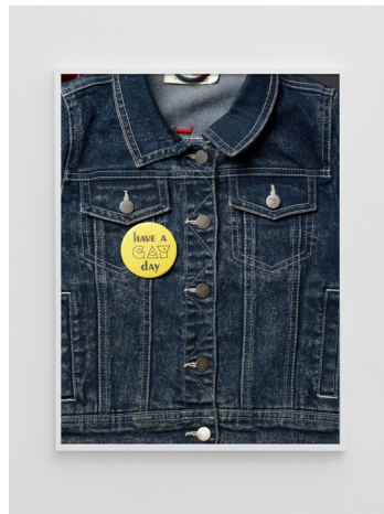
ANNETTE KELM Jeans Buttons, Have a Gay Day , 2023

Archival pigment print 21 3/4 x 16 3/8 inches (55.4 x 41.5 cm.); 22 1/4 x 16 7/8 x 1 1/2 inches (56.5 x 42.9 x 3.8 cm.) framed Edition of 6 plus 2 artist's proofs (ANK23-009)