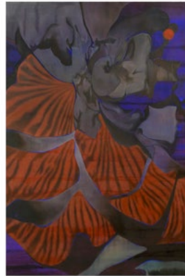
HENRY SHUM Away Thoroughly from Dust and Echoes , 2022

Oil on canvas 35 3/8 x 23 5/8 inches (90 x 60 cm.) (HES22-005)