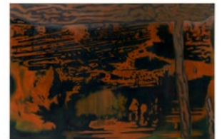
HENRY SHUM Ghost , 2022

Oil on canvas 78 3/4 x 52 3/8 inches (200 x 133 cm.) (HES22-001)