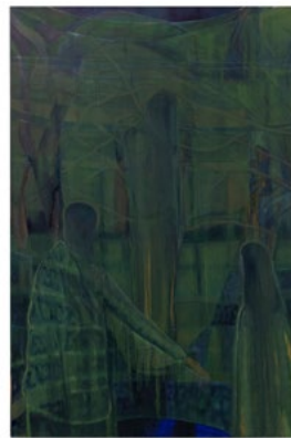
HENRY SHUM Maar , 2022

Oil on canvas 47 1/4 x 31 1/2 inches (120 x 80 cm.) (HES22-003)