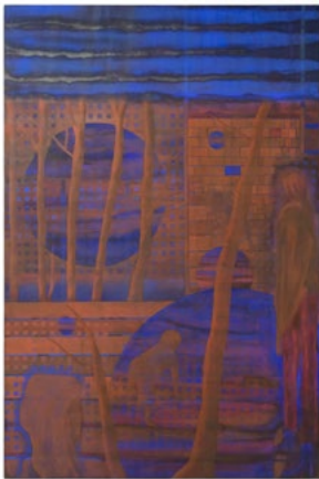
HENRY SHUM Circles (of Woman and Man) , 2022

Oil on canvas 47 1/4 x 31 1/2 inches (120 x 80 cm.) (HES22-002)