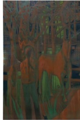
HENRY SHUM Lunar pilgrimage , 2022

Oil on canvas 78 3/4 x 52 3/8 inches (200 x 133 cm.) (HES22-010)