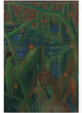
HENRY SHUM Shapeshift (Long to Disremember) , 2022

Oil on canvas 70 7/8 x 47 1/4 inches (180 x 120 cm.) (HES22-007)