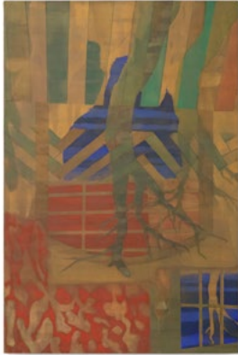
HENRY SHUM Shadowplay , 2022

Oil on canvas 35 3/8 x 23 5/8 inches (90 x 60 cm.) (HES22-005)