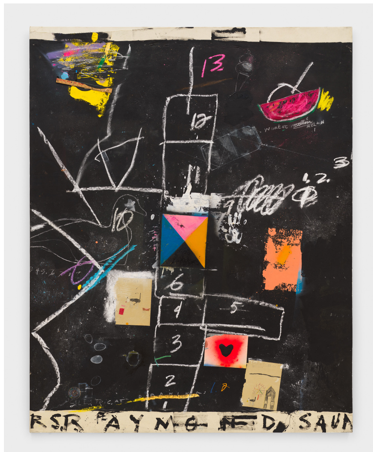
Raymond Saunders, Celeste Age 5 Invited Me To Tea , 1986. Mixed media on canvas, 104 x 83 1/8 inches.

Yet Saunders's marks aren't only reactions. He often uses pictorial deconstruction to probe the foundations of visual experience. At various moments, Saunders stops just as gesture begins to feel like it will cohere into a painting. His motifs remain as metonyms of pictures. Blotches of red, yellow, and blue