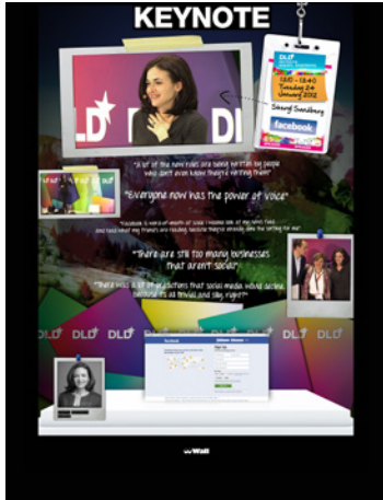
SIMON DENNY 13.10 KEYNOTE, 2013

UV print on a pretty glossy, white canvas 43 1/4 x 63 inches (110 x 160 cm.) (SID21-001)