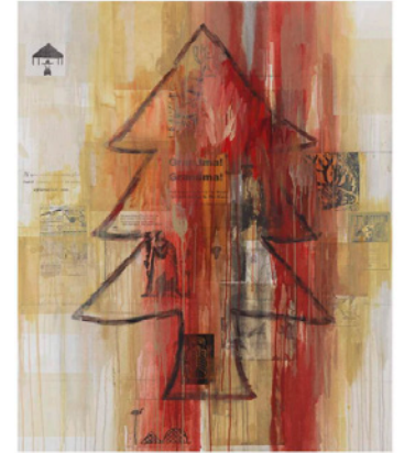
JAUNE QUICK-TO-SEE SMITH I See Red: Grandma! Grandma! (Red in the Hood), 1998

Exhibited as: live television broadcast on a monitor, vinyl lettering 13 3/4 x 14 x 7 inches (34.9 x 35.6 x 17.8 cm.) (GRB21-001)