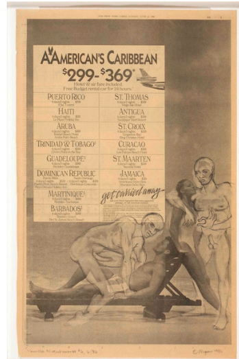
ADRIAN PIPER Vanilla Nightmares #6 , 1986

UV print on a pretty glossy, white canvas 43 1/4 x 63 inches (110 x 160 cm.) (SID21-001)