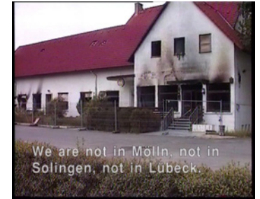
HITO STEYERL Babenhausen , 1997

Wood, aqua resin, casein, paper 58 x 47 x 1 1/2 in (147.3 x 119.4 x 3.8 cm.) (SAB21-001)