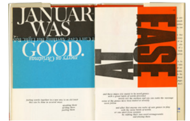
CORITA KENT footnote and headlines: a play- pray book , 1967

Acrylic on canvas 48 x 48 in (121.9 x 121.9 cm.) (BS21-001)