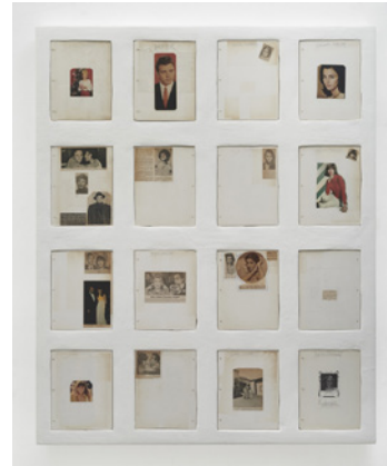
SADIE BENNING "F", 2018

Charcoal drawing on New York Times page from Sunday, June 22, 1986 22 x 13 3/4 in (55.9 x 34.9 cm.) (AP21-001)