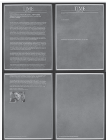
ANDREA BOWERS Eulogies to One and Another (Time World, 1 of 4; 2 of 4; 3 of 4; 4 of 4), 2006

Signed and dated on verso Mixed media on canvas 60 x 50 in (152.4 x 127 cm.) (JQS21-002)