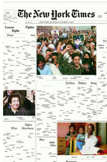
SARAH CHARLESWORTH- Nouns , 2003

Photo montage 20 x 16 in (50.8 x 40.6 cm.) Edition 3 of 10 plus 2APs (MAR21-002.3)