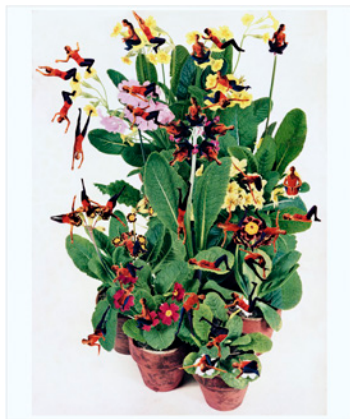
MARTHA ROSLER Flower Power , from the series Body Beautiful, or Beauty Knows No Pain , c. 1966-72

Print book 50 pages illustrations (some color)