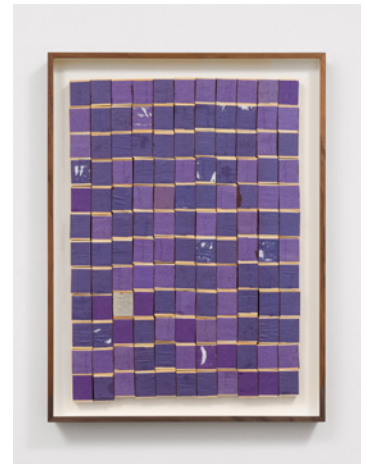
ANTONIO TARSIS O céu em pedaços (Sky in pieces) IV, 2021

Collage on paper 12 5/8 x 9 1/2 in (32 x 24 cm.) (AR21-001)