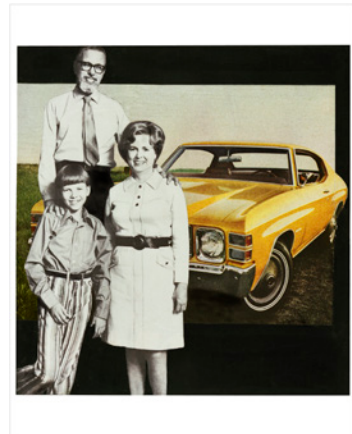
MARTHA ROSLER Family Portrait with Car , from the series Body Beautiful, or Beauty Knows No Pain , c. 1966- 72

Photomontage 24 x 20 in (61 x 50.8 cm.) Edition 1 of 10 plus 2 APs (MAR21-003.1)