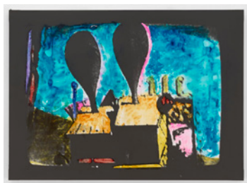
MARIO SCHIFANO Untitled (ore 22,15 maestro italiano del '900 - 10:15 p.m. Omaggio a de Chirico / Italian Masters of the 1900 - Homage to de Chirico) , 1976

Photographic emulsion and enamel on canvas 31 1/2 x 43 1/4 in (80 x 110 cm.) (MAS21-001)