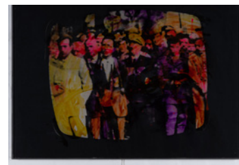
MARIO SCHIFANO Paesaggio TV , 1969-1970

Photographic emulsion and enamel on canvas 31 1/2 x 43 1/4 in (80 x 110 cm.) (MAS21-001)