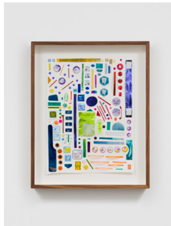
ANTONIO TARSIS Mining III, 2021

Graphite on paper 65 3/8 x 49 in (166 x 124.4 cm) (AB13-016)