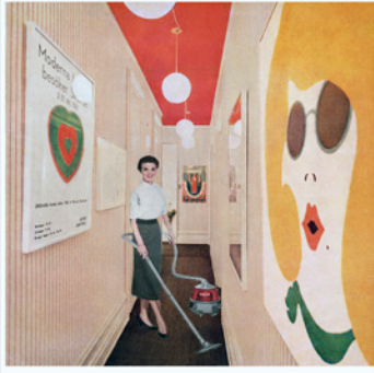
MARTHA ROSLER Vacuuming Pop Art, from the series Body Beautiful, or Beauty Knows No Pain, c. 1966-72

Photo montage 24 x 21 inches (61 x 53.3 cm.) Edition of 10 plus 2 artist's proofs (MAR21-001)