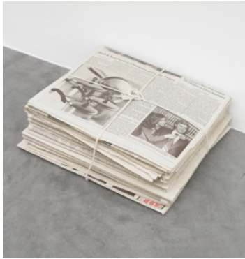
ROBERT GOBER Newspaper , 1992

Photolithography on archival Mohawk Superfine paper, twine 6 x 16 1/4 x 13 1/4 in (15.2 x 41.3 x 33.7 cm.) Edition 6 of 10 (RG21-001)