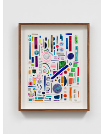
ANTONIO TARSIS Mining IV, 2021

Collage on paper 12 5/8 x 9 1/2 in (32 x 24 cm.) (AR21-002)