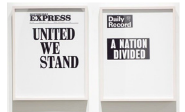
SARAH CHARLESWORTH United We Stand/A Nation Divided , 1978

Signed on verso Fuji Crystal Archive print 21 3/4 x 13 1/2 in (55.2 x 34.3 cm) Edition 2 of 5 plus 2 APs (SAC21-001.2)