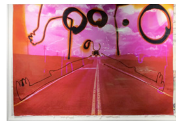
HADI FALLAHPISHEH On The Road

Photographic emulsion and enamel on canvas 31 1/2 x 43 1/4 in (80 x 110 cm.) (MAS21-004)