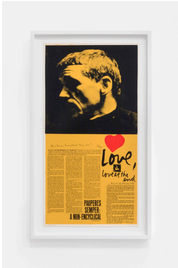
CORITA KENT love at the end , 1969

Screenprint 22 ½ × 11 ⅞ in (57.2 × 30.2 cm); framed: 26 × 15 × 1 ½ in (66 × 38.1 × 3.8 cm) (CK19-010)