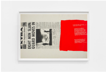
CORITA KENT my people, 1965

Screenprint 23 × 35 inches (58.4 × 88.9 cm.) (CK21-004)