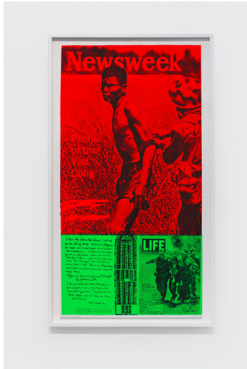
CORITA KENT news of the week, 1969

Screenprint 23 1/8 x 12 1/8 in (58.7 x 30.8 cm) (CK20-062)