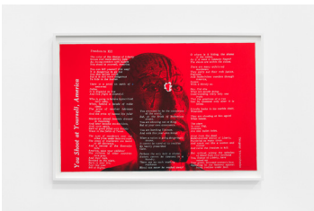
CORITA KENT you shoot at yourself, america, 1968

Screenprint 21 × 35 in (53.3 × 88.9 cm) (CK20-037)