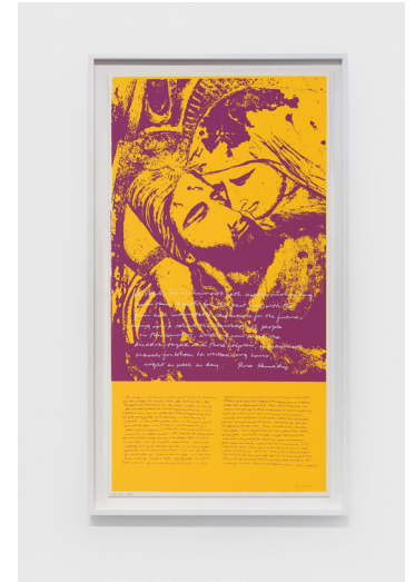
CORITA KENT pieta 1969, 1969

Screenprint 23 × 9 inches (58.4 × 22.9 cm.) (CK21-010)