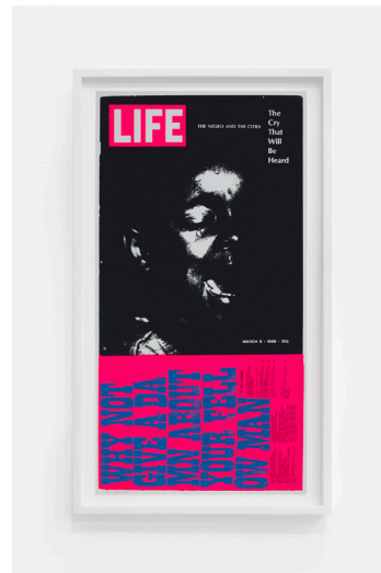
CORITA KENT the cry that will be heard, 1969

Screenprint 12 × 23 inches (30.5 × 58.4 cm.) (CK21-013)