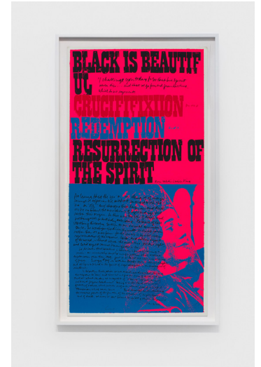
CORITA KENT if i , 1969

Screenprint 22 ½ × 11 ½ in (57.2 × 29.2 cm) (CK21-018)