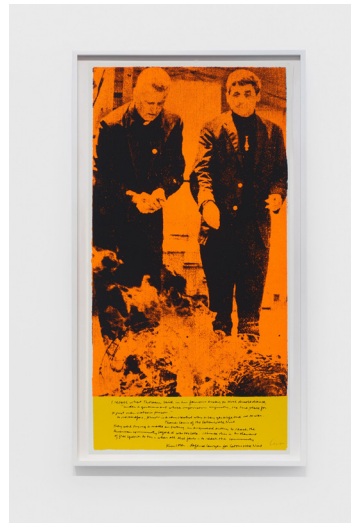
CORITA KENT phil and dan , 1969

Screenprint 22 ½ × 11 ⅞ in (57.2 × 30.2 cm); framed: 26 × 15 × 1 ½ in (66 × 38.1 × 3.8 cm) (CK19-010)