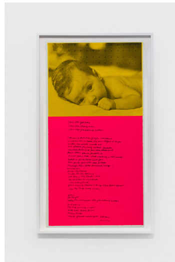
CORITA KENT christy , 1969

Screenprint 23 × 12 inches (58.4 × 30.5 cm.) (CK20-021)