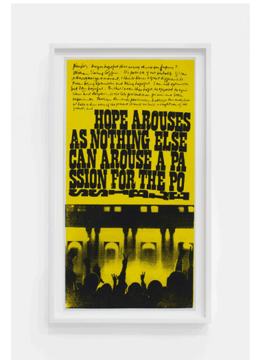
CORITA KENT a passion for the possible, 1969

Screenprint 23 × 12 inches (58.4 × 30.5 cm.) (CK19-024)