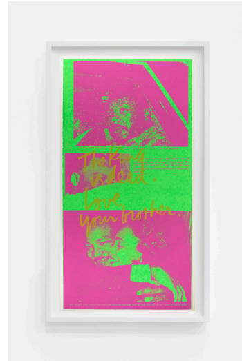
CORITA KENT love your brother, 1969

Screenprint 22 1/2 x 11 1/2 in (57.2 x 29.2 cm) (CK20-022)