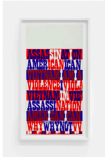
CORITA KENT american sampler, 1969

Screenprint 23 1/8 x 12 1/8 in (58.7 x 30.8 cm) (CK20-062)