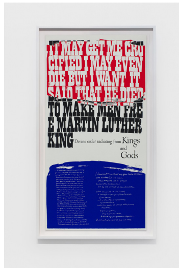
CORITA KENT king's dream, 1969

Screenprint 23 x 12 inches (58.4 x 30.5 cm.) (CK19-032)