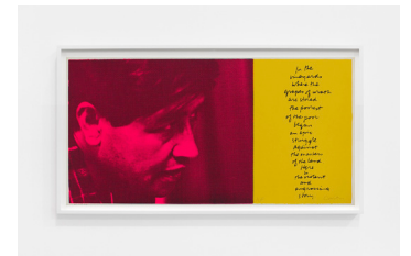
CORITA KENT chavez , 1969

Screenprint 23 × 12 inches (58.4 × 30.5 cm.) (CK20-061)