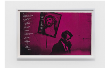
CORITA KENT in memory of rfk, 1968

Screenprint left panel: 23 × 11 ¾ inches (58.4 × 29.8 cm.); right panel: 23 × 11 ½ inches (58.4 × 29.2 cm.) (CK20-093)