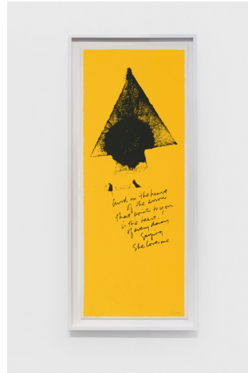
CORITA KENT heart of the arrow, 1969

Screenprint 23 × 12 in (58.4 × 30.5 cm) (CK19-033)