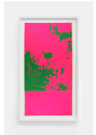
CORITA KENT third eye, 1969

Screenprint 23 x 12 inches (58.4 x 30.5 cm.) (CK19-028)