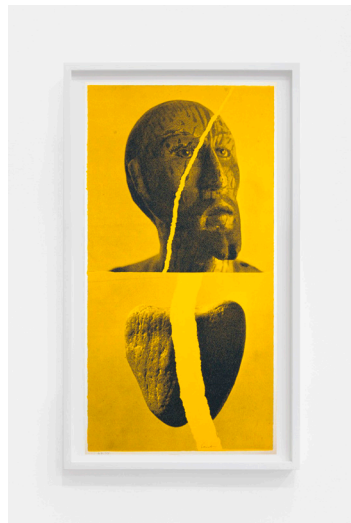
CORITA KENT sacred heart , 1969

Screenprint 22 ½ × 11 ½ in (57.2 × 29.2 cm) (CK19-011)