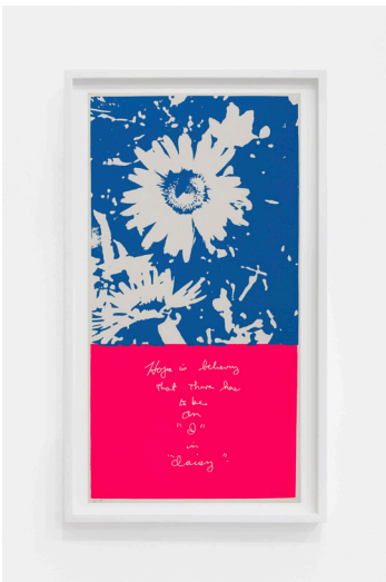
CORITA KENT i in daisy , 1969

Screenprint 23 × 12 inches (58.4 × 30.5 cm.) (CK20-094)