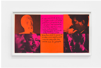
CORITA KENT it can be said of them, 1969

Screenprint 12 × 23 (30.5 × 58.4 cm.) (CK21-009)