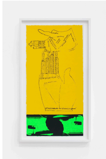
CORITA KENT green fingers, 1969

Screenprint 23 × 35 inches (58.4 × 88.9 cm.) (CK21-004)