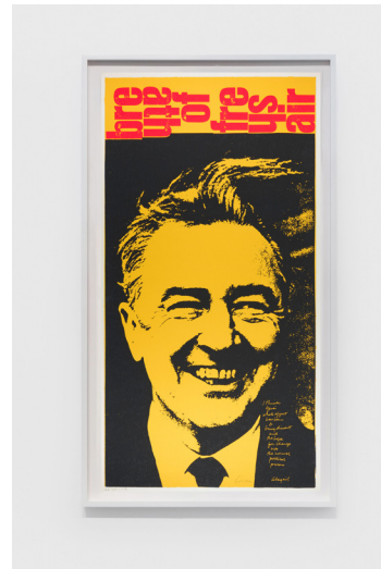
CORITA KENT a breath of fresh air , 1969

Screenprint 22 ½ × 11 ½ in (57.2 × 29.2 cm) (CK21-017)