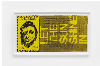
CORITA KENT the stamp of thoreau, 1969

Screenprint 22 ½ × 11 ½ inches (57.1 × 29.2 cm.) (CK21-012)