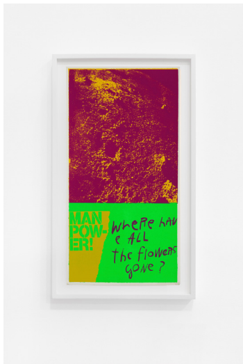
CORITA KENT moonflowers, 1969

Screenprint Yellow: 22 3/4 x 11 5/8 in (57.8 x 29.5 cm); green: 22 3/4 x 11 5/8 in (57.8 x 28.9 cm) (CK19-008)