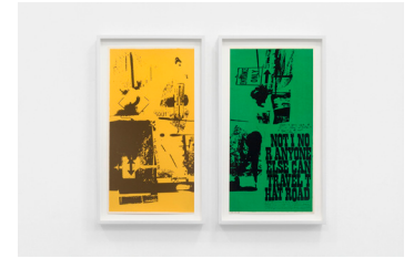
CORITA KENT road signs (part 1 and 2), 1969

Screenprint 22 1/2 x 11 1/2 in (57.2 x 29.2 cm) (CK21-015)