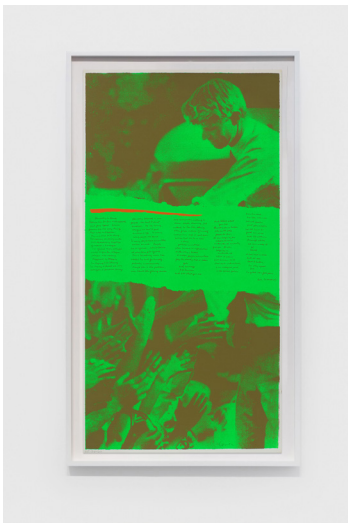
CORITA KENT i'm glad i can feel pain, 1969

Screenprint 23 × 12 inches (58.4 × 30.5 cm.) (CK21-011)