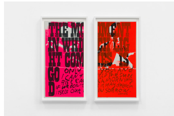
CORITA KENT only you and i (two parts), 1969

Screenprint 12 × 23 (30.5 × 58.4 cm.) (CK21-009)