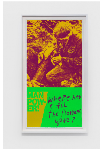
CORITA KENT manflowers, 1969

Screenprint 23 1/8 x 12 1/8 in (58.7 x 30.8 cm) (CK21-016)