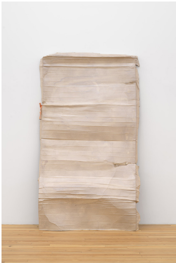
LIZ MAGOR Another Place , 2021

Silicon rubber, polyester, work- bench, coffee table 52 x 115 x 56 inches (132.1 x 292.1 x 142.2 cm.); stork: 8 ½ x 45 x 18 inches (21.6 x 114.3 x 45.7 cm.); workbench: 33 1/2 x 95 x 28 inches (85.1 x 241.3 x 71.1 cm.) (LMA21-002)