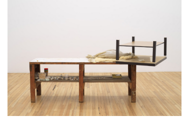
LIZ MAGOR Float , 2021

Silicon rubber, polyester, work- bench, coffee table 50 ½ x 71 x 47 inches (128.3 x 180.3 x 119.4 cm.); lion: 11 x 54 x 24 inches (27.9 x 137.2 x 61 cm.); workbench: 32 ¼ x 52 x 39 ½ inches (81.9 x 132.1 x 100.3 cm.) (LMA21-003)