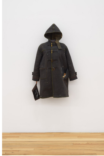
LIZ MAGOR Perennial , 2021

Silicon rubber, polyester, work- bench, shelves 42 x 90 x 31 inches (106.7 x 228.6 x 78.7 cm.); giraffe: 8 ½ x 60 x 26 inches (21.6 x 152.4 x 66 cm.); workbench: 34 ½ x 72 x 25 ½ inches (87.6 x 182.9 x 64.8 cm.) (LMA21-004)