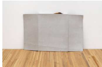
LIZ MAGOR Wasted , 2021

Polymerized gypsum (alpha gypsum, acrylic medium), fiberglass 98 x 66 x 11 inches (248.9 x 167.6 x 27.9 cm.) (LMA21-006)