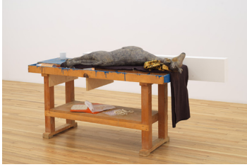
LIZ MAGOR Stall , 2021

Silicon rubber, polyester, work- bench, shelves 42 x 90 x 31 inches (106.7 x 228.6 x 78.7 cm.); giraffe: 8 ½ x 60 x 26 inches (21.6 x 152.4 x 66 cm.); workbench: 34 ½ x 72 x 25 ½ inches (87.6 x 182.9 x 64.8 cm.) (LMA21-004)