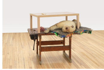
LIZ MAGOR Drift , 2021

Duffle coat 45 x 28 x 12 inches (114.3 x 71.1 x 30.5 cm.) (LMA21-001)