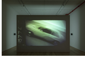
KEVIN JEROME EVERSON Opel, 2021

Five rubber cones each 28 × 14 × 14 inches (71.1 × 35.6 × 35.6 cm.)