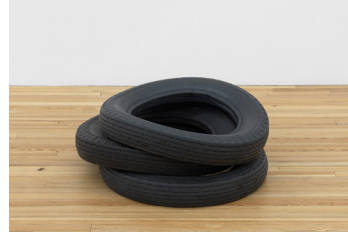
KEVIN JEROME EVERSON Mansfield Deluxe, 2021

Installation of 16mm film transfer to HD, dual projection, sound, rubber cones, rubber tires Videos: 2 minutes, 31 seconds Cones: each cone 28 × 14 × 14 inches (71.1 × 35.6 × 35.6 cm.) Tires: each tire 14 × 36 × 32 inches (35.6 × 91.4 × 81.2 cm.)