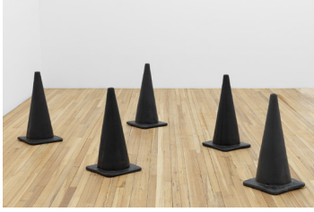
KEVIN JEROME EVERSON Signal Thirty, 2021

Five rubber cones each 28 × 14 × 14 inches (71.1 × 35.6 × 35.6 cm.)