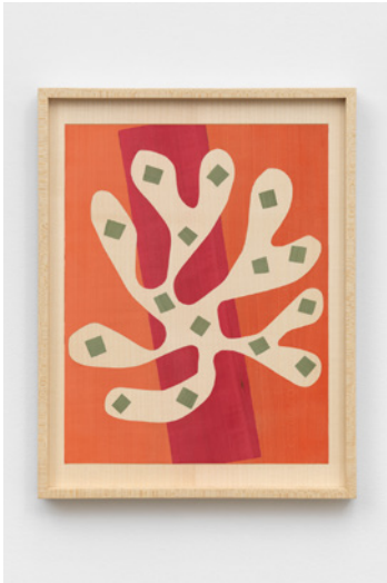
CAMILLE BLATRIX Untitled, 2021

Wooden marquetry 12 ¼ × 9 ½ × ⅞ inches (31 × 24 × 2.2 cm)