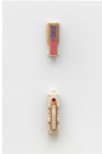
CAMILLE BLATRIX Ask OFF, 2021

Pear wood, acrylic resin, stainless steel, led system, electronic components 31 ½ × 5 ⅝ × 13 ⅜ inches (80 × 14.3 × 34 cm)