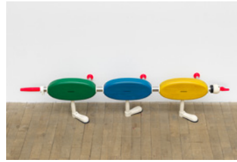
CAMILLE BLATRIX 3 COLORS: G A S, 2021

Pear wood, acrylic resin, stainless steel, led system Top: 13 ⅝ × 5 ½ × 2 ¾ inches (34.6 × 14 × 7 cm.); bottom: 16 ¾ × 4 ¾ × 4 ¾ inches (42.5 × 12.1 × 12.1 cm)