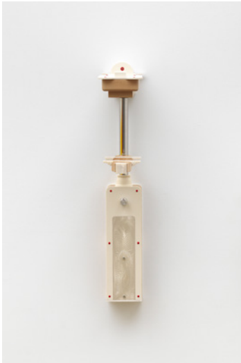
CAMILLE BLATRIX Ask ON, 2021

Pear wood, acrylic resin, stainless steel, led system, electronic components 31 ½ × 5 ⅝ × 13 ⅜ inches (80 × 14.3 × 34 cm)