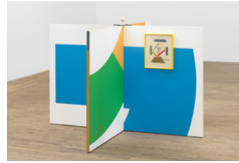
CAMILLE BLATRIX They play We play, 2021

Pear wood, acrylic resin 7 ½ × 9 ½ × 2 inches (19.1 × 24.1 × 5.1 cm)