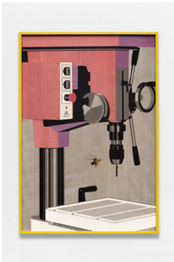
CAMILLE BLATRIX Queen Bee, 2021

Acrylic resin, wood, printed laminata, led system, elec- tronic component, wooden marquetry 78 ¾ × 78 ¾ inches (200 × 200 cm.); marquetry: 13 ¾ × 11 ¾ × 1 inches (35 × 30 × 2.5 cm)