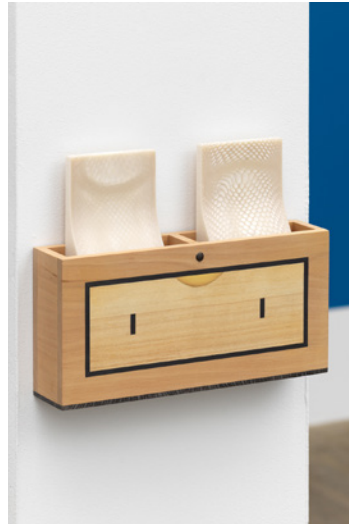
CAMILLE BLATRIX Untitled, 2021

Wooden marquetry 12 ¼ × 9 ½ × ⅞ inches (31 × 24 × 2.2 cm)