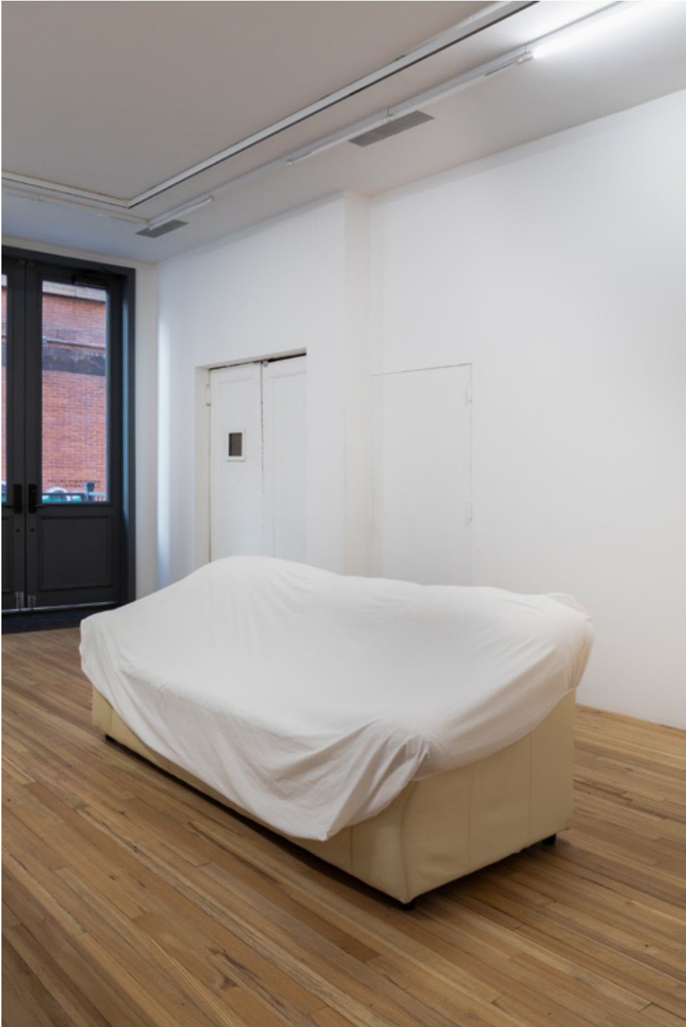
Michael E. Smith Untitled, 2020 Sofa, bed sheet 34 x 85 x 35 in (86.4 x 215.9 x 88.9 cm) (Inv# MES20-004)