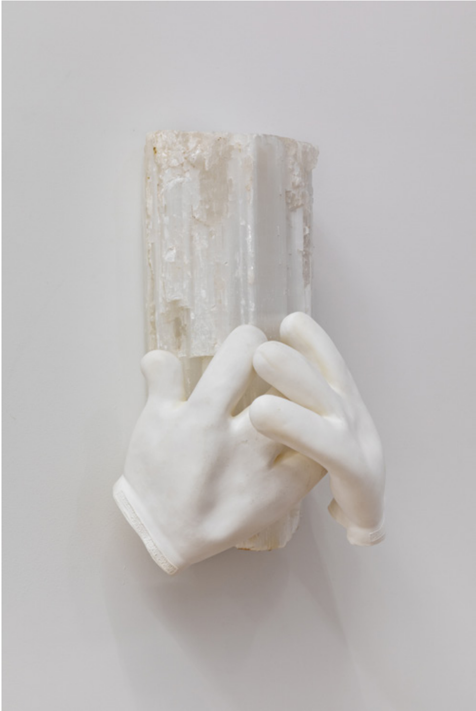
Michael E. Smith Untitled, 2020 Selenite, gloves 16 1/4 x 9 3/4 x 9 in (41.3 x 24.8 x 22.9 cm) (Inv# MES20-015)