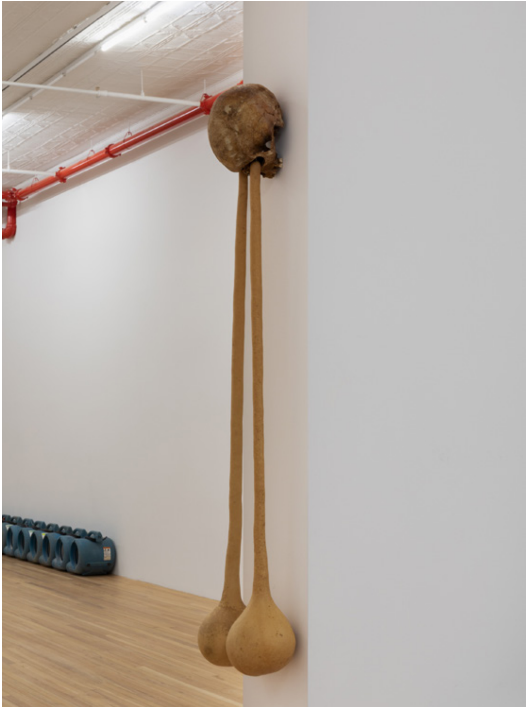
Michael E. Smith Untitled , 2020 Skull, gourds 48 1/2 x 10 3/4 x 6 5/8 in (123.2 x 27.3 x 16.8 cm) (Inv# MES20-002)