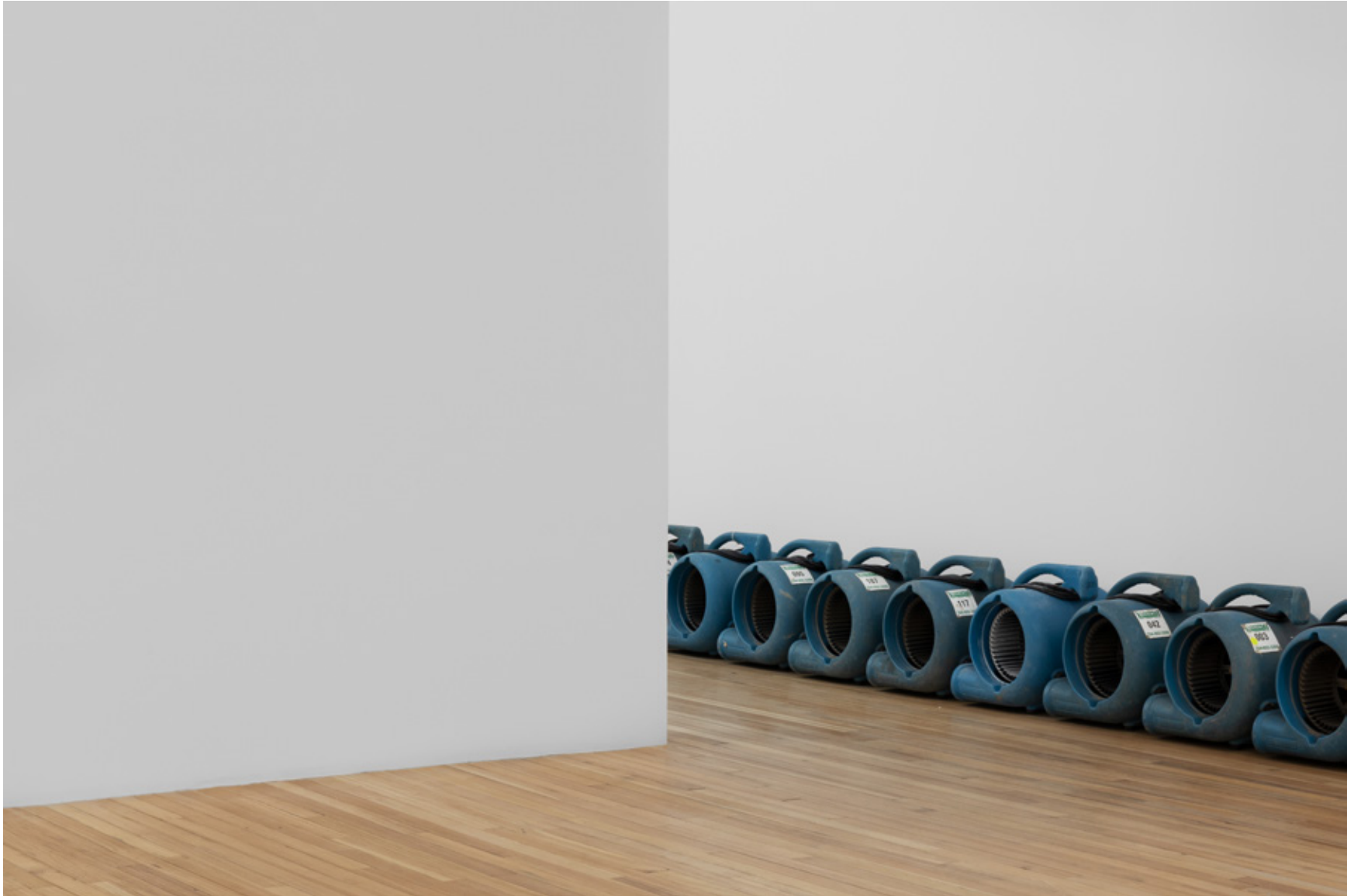
Detail view: Michael E. Smith Untitled , 2020 Fans, bird sounds Dimensions variable (Inv# MES20-005)