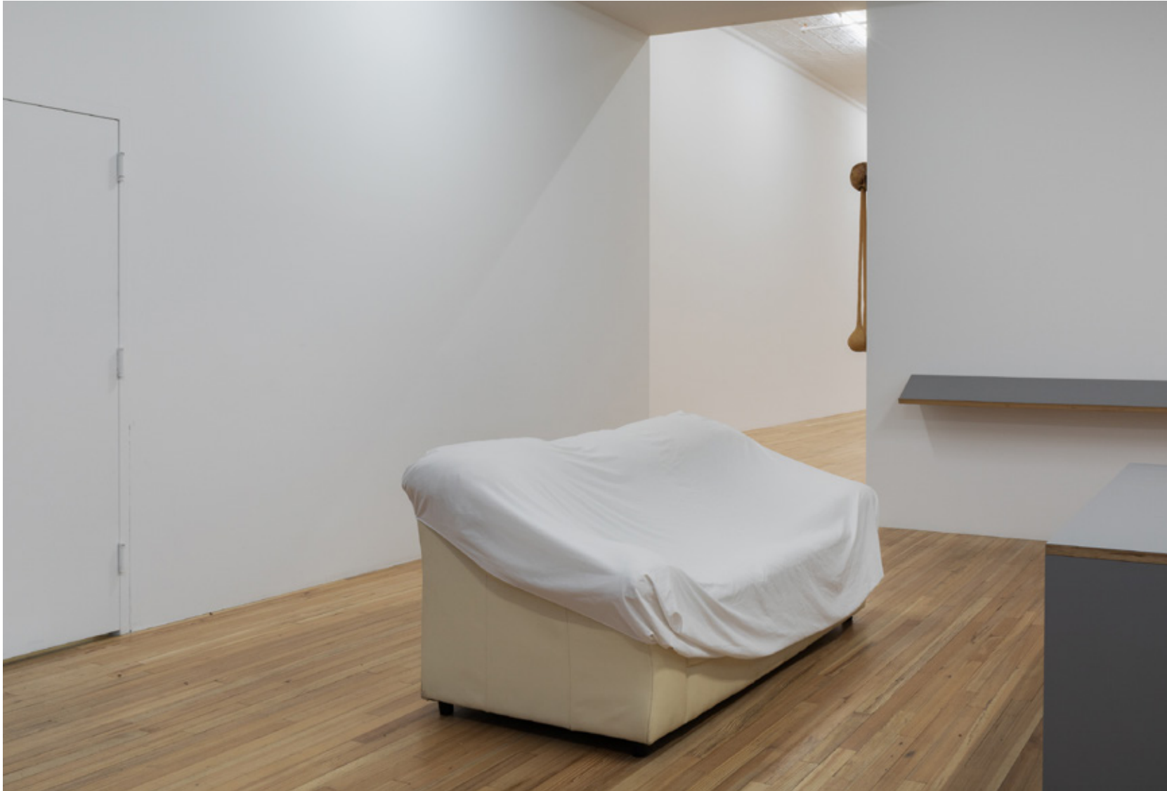
Alternate view: Michael E. Smith Untitled, 2020 Sofa, bed sheet 34 x 85 x 35 in (86.4 x 215.9 x 88.9 cm) (Inv# MES20-004)