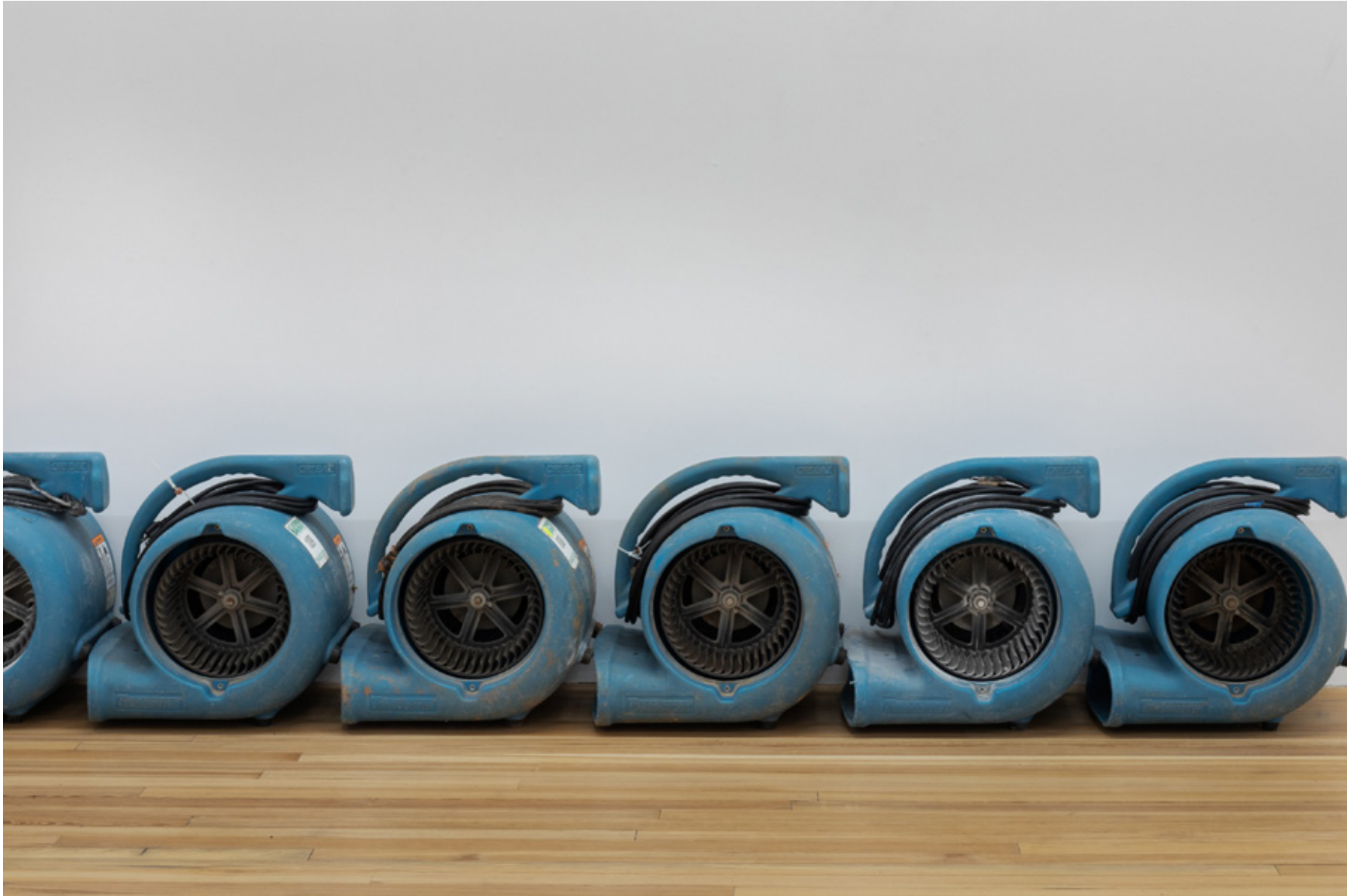
Detail view: Michael E. Smith Untitled , 2020 Fans, bird sounds Dimensions variable (Inv# MES20-005)