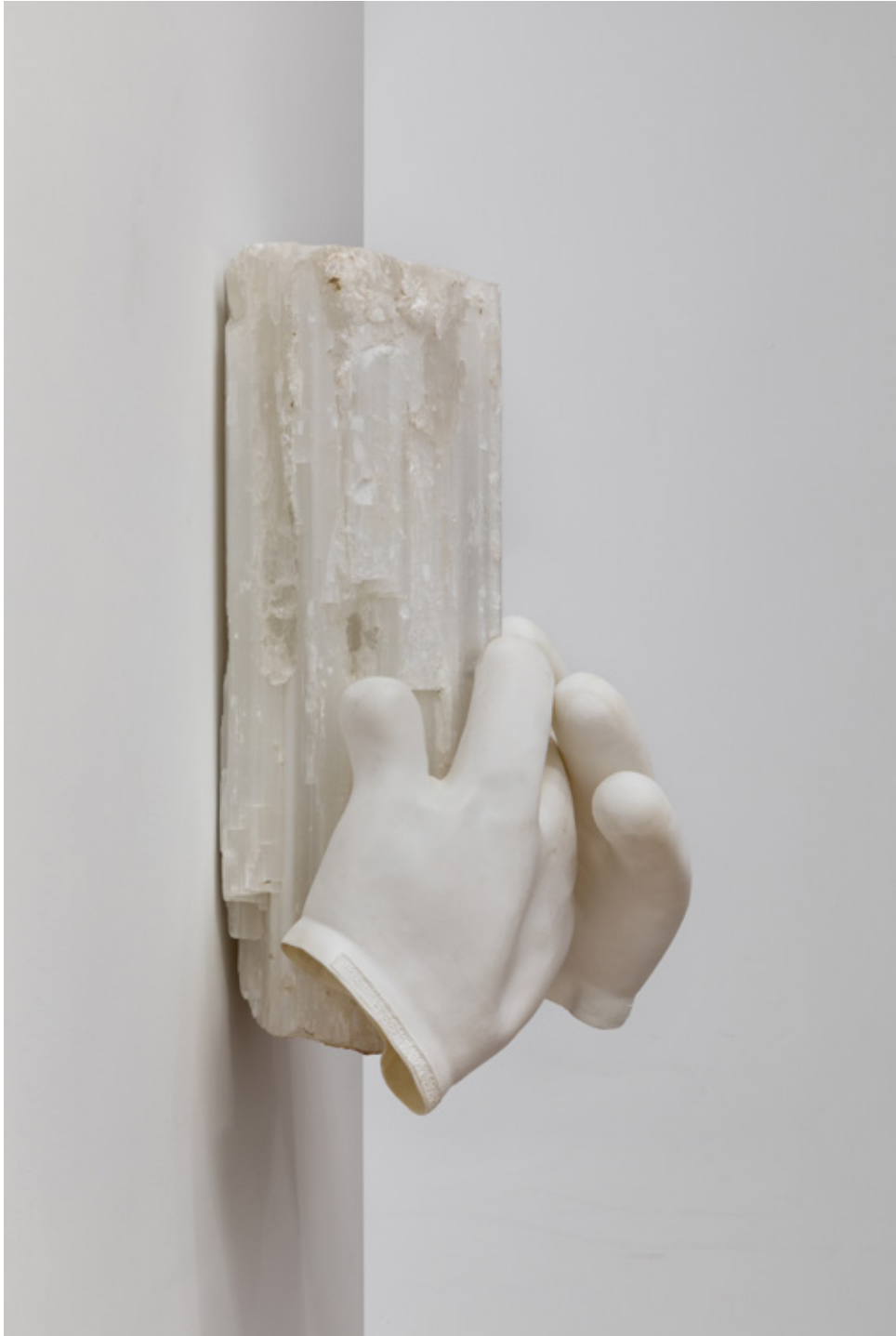
Alternate view: Michael E. Smith Untitled, 2020 Selenite, gloves 16 1/4 x 9 3/4 x 9 in (41.3 x 24.8 x 22.9 cm) (Inv# MES20-015)