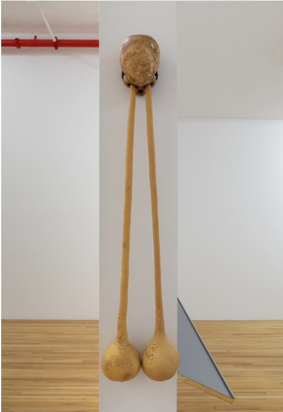
Alternate view: Michael E. Smith Untitled, 2020 Skull, gourds 48 1/2 x 10 3/4 x 6 5/8 in (123.2 x 27.3 x 16.8 cm)